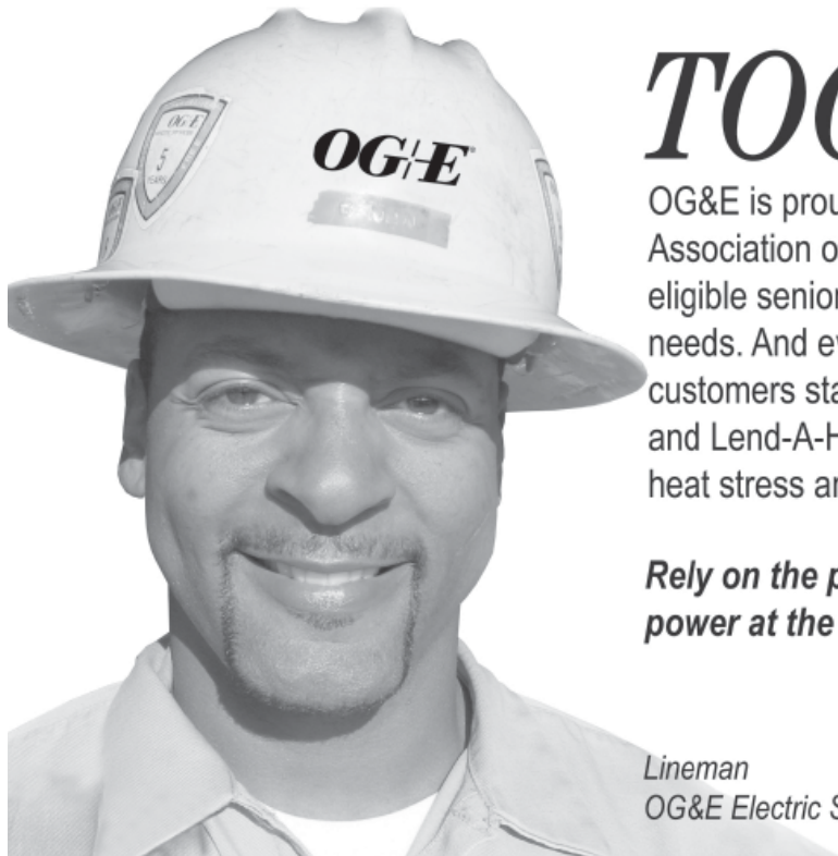
Lineman OG&E Electric Services

Rely on the positive energy™ of OG&E people for power at the speed of life.™