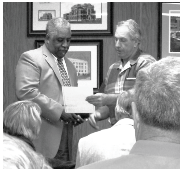
The Comanche County Board of County Commissioners issued a proclamation designating May as Community Action Month.