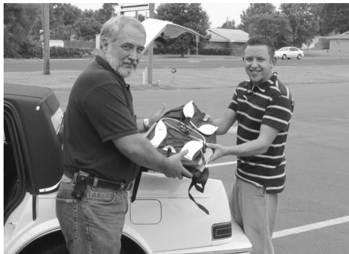
The Assembly of God church in Tuttle donated backpacks to Washita Valley Community Action Council to be used in the Head Start program.