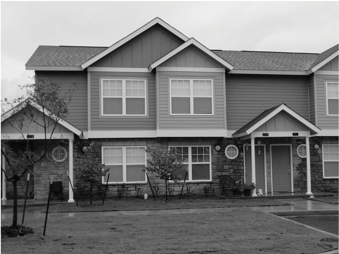
United Community Action Program developed a 20-unit affordable housing complex in Pawnee. The project had five buildings with four units in each building. The units ranged from 1100 to 1260 square feet in size and were furnished with all major appliances.