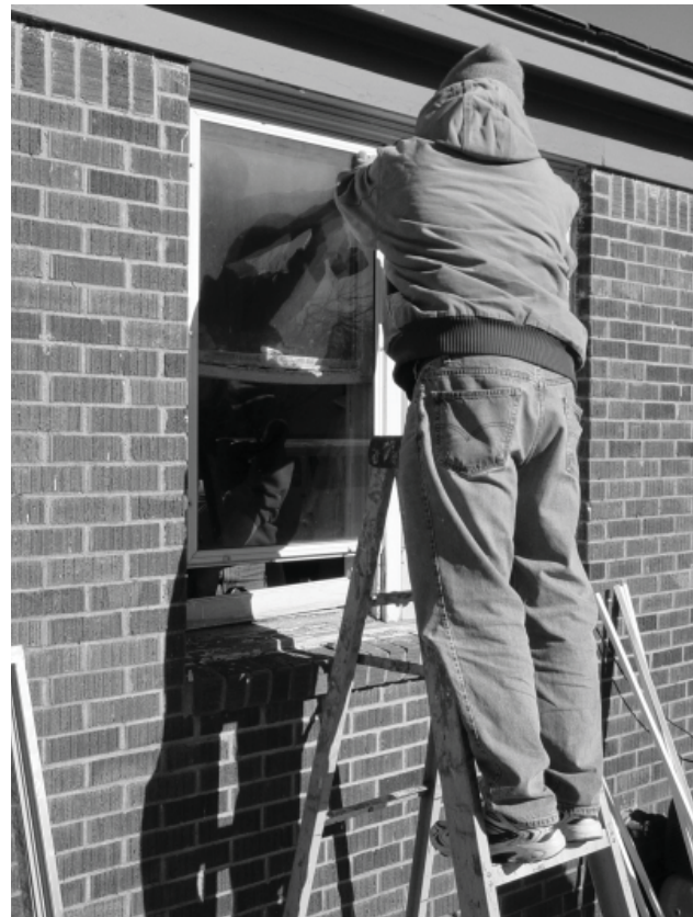
The Community Action Agency of Oklahoma City and Oklahoma/Canadian Counties weatherized more than 300 houses last year to improve their energy efficiency and reduce utility costs.

She has also received free tax preparation assistance from the agency for the past two years.