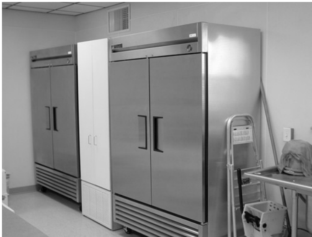
Commercial quality, energy efficient appliances were purchased for the Head Start center kitchen.