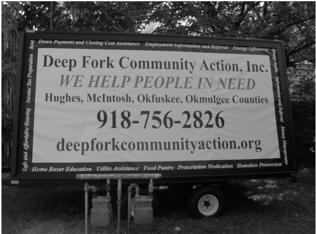
Deep Fork Community Action uses this trailer with changeable vinyl signs to promote its programs. The trailer can be towed in parades or parked in different locations in the agency's four-county service area.