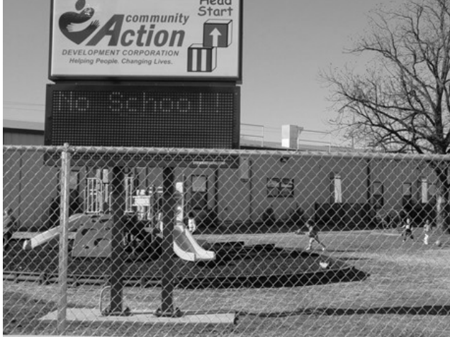
The Head Start center is located on a major highway leading into Frederick giving it high visibility in the community.