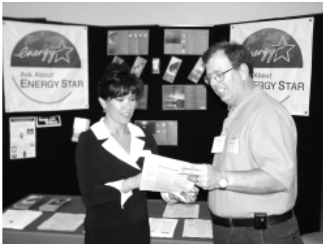
Exhibitors distributed literature on programs, products and services to conference attendees.

The 11th Annual Housing and Weatherization Conference featured a variety of programs on topics ranging from “Working with the State Historic Preservation Office” to “Low Income Tax Credits.” The conference was sponsored by the Oklahoma Weatherization and Housing Advisory Council.