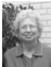
Melva Gardner Community Action Development Corporation