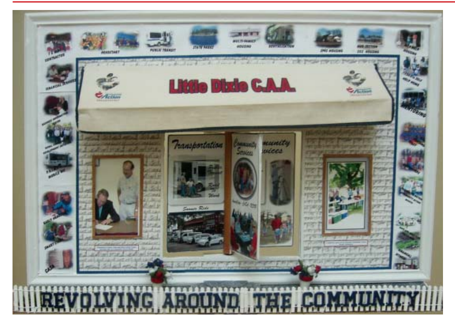
Little Dixie Community Action Agency's storyboard won the first place award at the Community Action Partnership 2006 Annual Conference held in Orlando.